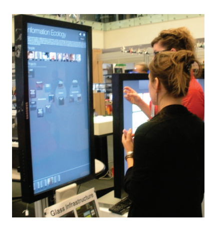
Figure 1: A student shares their work with a Media Lab sponsor using the Glass Infrastructure.

what we see(Egeth and Yantis 1997). When we explore artifacts in physical space, our interests make relevant properties of those artifacts seem more salient, and this makes navigating the space more manageable. In the flat world of the GI, where small images are substituted for the artifacts themselves, there is much less information to guide user salience. Therefore, we explicitly introduced a means to call attention to artifacts related to users' expressed interests, called "charms". Users can charm artifacts they're interested in, and these charms persist across time (users wear RFID badges that identify them to each screen, and allow their charms to be saved and reloaded) In this way, charming an artifact is similar to bookmarking or favoriting. The key distinction is our ubiquitous use of charms throughout the interface to call attention to people, groups, ideas, and projects related to users' interests.