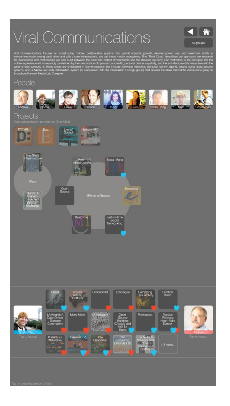
Figure 2: Two users logged into a screen. Image shows research group detail view with favorited projects indicated by heart shaped badges, in molecule configuration clustered by OCMS

She can then favorite projects she is interested in and these are stored in a personal profile she can access after the visit. Projects that are her favorites are demarcated with heart shaped badges.